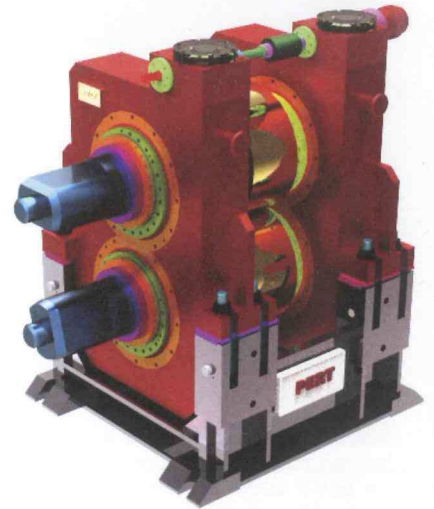
The BS mill stand

The smaller overall dimensions of the stands reduces investment costs to build the necessary foundations and requires extreme compactness of the technology (Fig 2). There is also a reduction in the height of overhead cranes (level of rails), the crane capacity needed is less, a shorter installation time can be achieved and a reduction in plant delivery time.